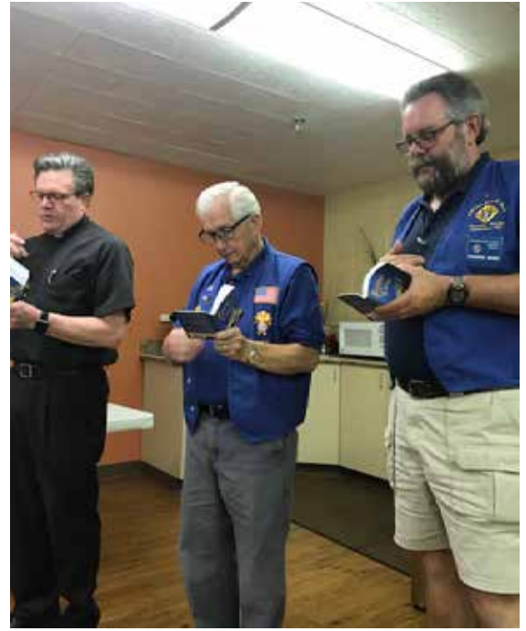
Knights to Christ retreat held at the Cabrini Shrine on September 14th, hosted by Council 9349.